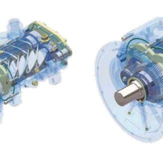
Typical Airend Size